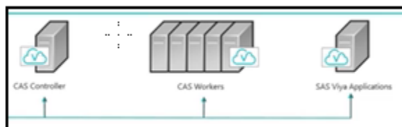
Figure 2 Distributed SAS Viya Installation [2]

In the Distributed configuration of SAS Viya you have multiple machines configured for CAS. This allows for parallel processing of SAS operations across multiple CAS Worker Nodes.