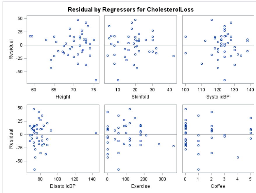
Figure 16: Scatter Plot Results for Testing Linearity

[Testing Linearity] Correlation Between Independent and Dependent Variable : For linear regression, there should be a moderate and SIGNIFICANT correlation score between dependent variable and independent variable.